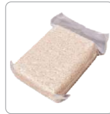
25 kg vacuum pack