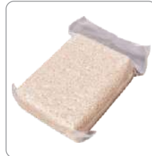
25 kg vacuum pack