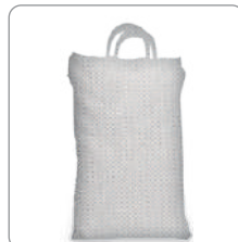
Non - woven bag