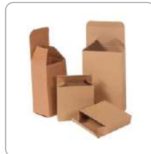
1 kg mono carton