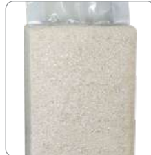
1 ton vacuum pack