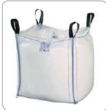
1 ton tote bag